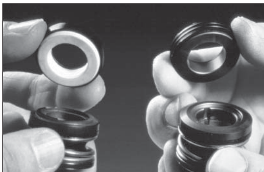
Silicon Carbide-to-Silicon Carbide